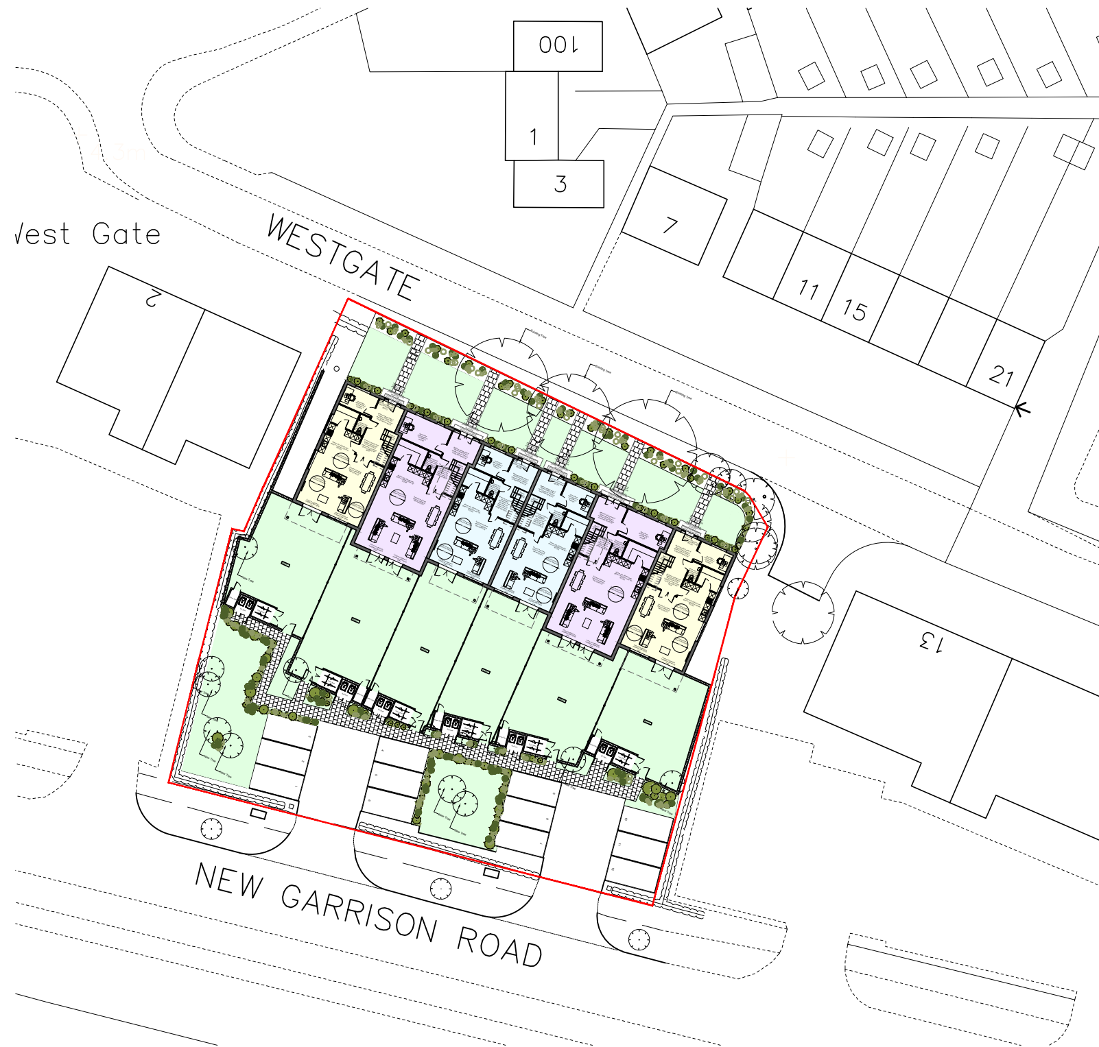
1 Site Plan

Do not scale this drawing. Work to figured dimensions only. This drawing is copyright of APS Designs and should only be reproduced with their express permission. Check all dimensions on site. Any discrepancies should be reported to APS Designs prior to commencement.