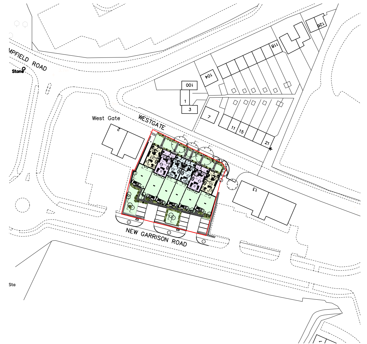
2 Location Plan